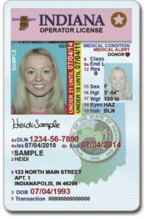
SecureID driver's license: Under 21 years of age

SecureID driver's license: Over 21 years of age