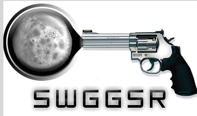
Scientific Working Group on Gunshot Residue (SWGSR) logo

The advancements in GSR examinations over the past 40 years have led to improved analysis and more reliable results. Further, communication among GSR analysts, especially via the Internet, is making difficult interpretation easier to understand by instantly sharing research and developments. This open communication has led to the recent formation of the Scientific Working Group on Gunshot Residue (SWGSR). Consensus among scientists performing GSR analysis is becoming a global reality. The SWGSR consists of an international conglomerate of experienced scientists who conduct research and issue guidelines for GSR investigations, examinations, reporting, and quality assurance to help GSR analyses and results become better understood and more reliable.