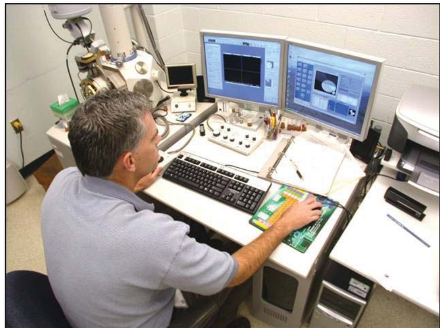
Hamilton County Coroner's Office SEM/EDS system

hands and wear gloves when sampling suspects to prevent contamination. While law enforcement personnel could be a potential source of GSR because they carry guns, studies have shown that few of them have particles on their hands because they clean their hands much more often than they touch their weapons. 14 Nevertheless, police officers should avoid contact with a subject's hands before sampling. If armed officers collect the samples, a disposable lab coat, along with proper hand washing and glove use, can minimize the risk of contamination. As police vehicles and interrogation rooms are potential sources of