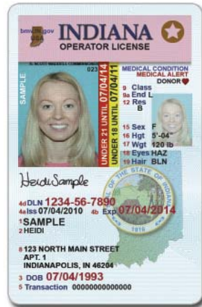
SecureID driver's license: Under 21 years of age

The security features include embedded digital enhancements to ensure security and authenticity. Some information is detectable only with a black light, while other secured data is embedded in a barcode on the back of the card. A vertical format is provided for Hoosiers under 21 years of age, with the dates the recipient turns age 18 and 21 designated in yellow and red.